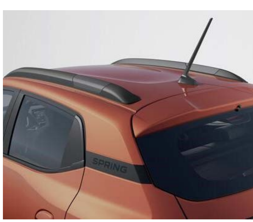
Decorative roof bars