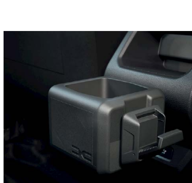
YouClip - multifunction cup holder