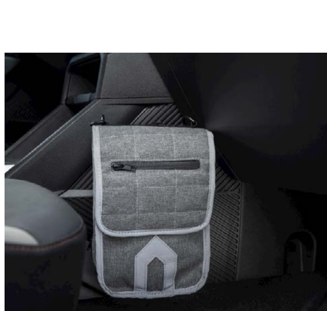
YouClip - bag