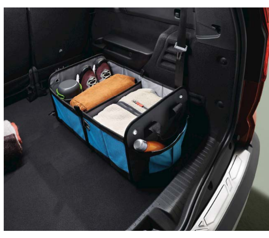
Compartmentalised boot storage box