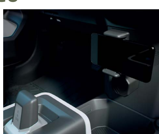
YouClip - smartphone holder