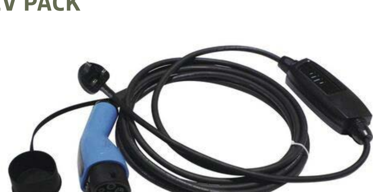
Domestic charging cable