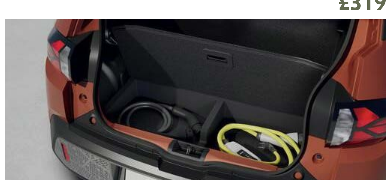
Double floor for cable storage