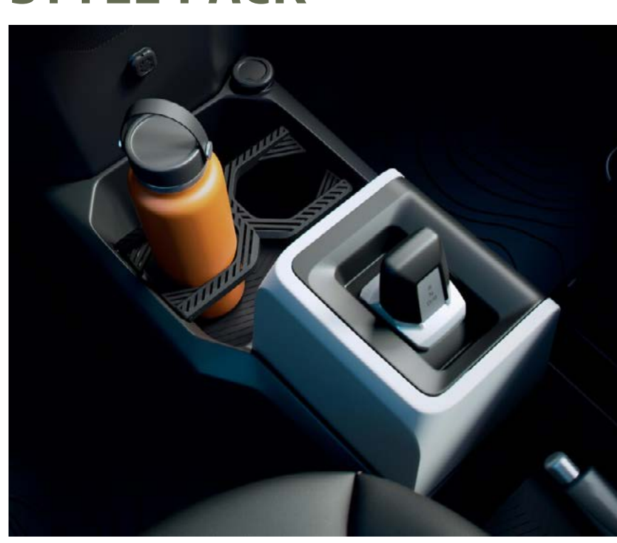
Dacia link cupholder