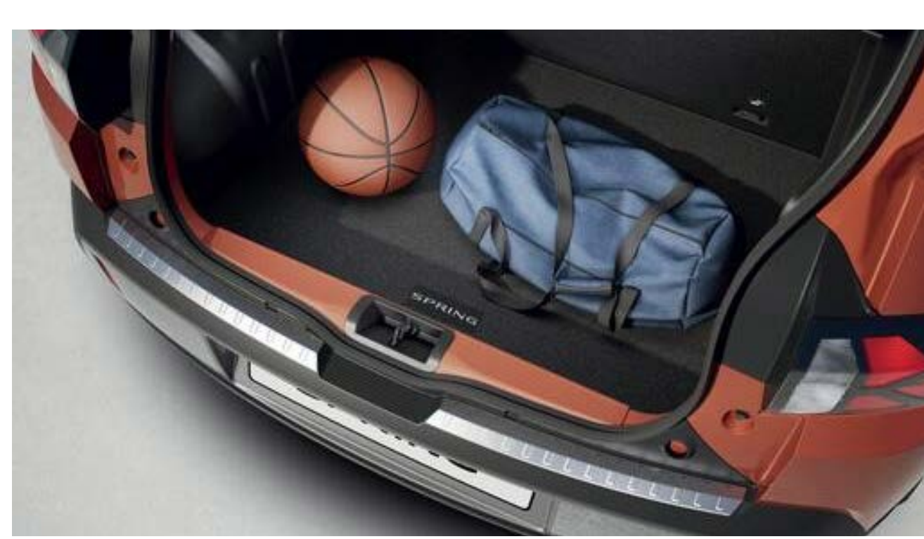
Reversible luggage compartment tray