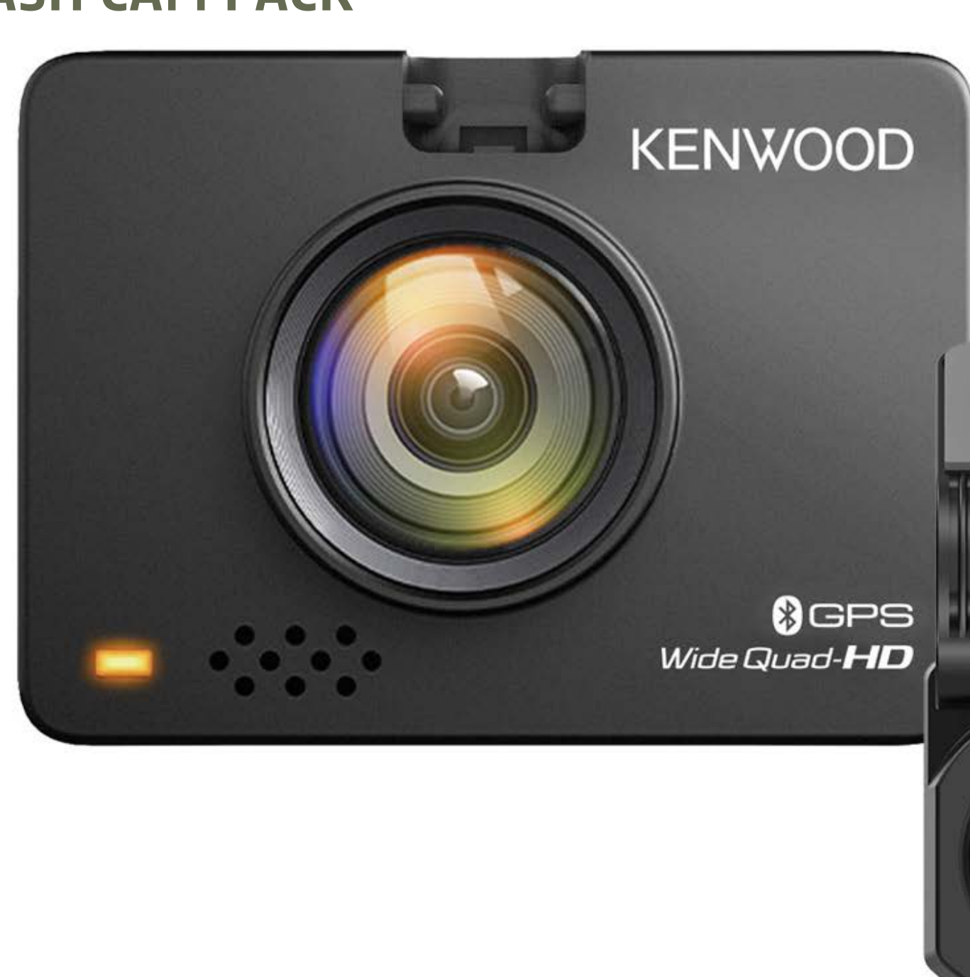
Front & rear cam hard wire pack