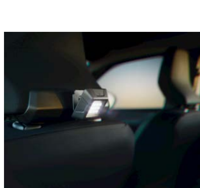
YouClip - lamp