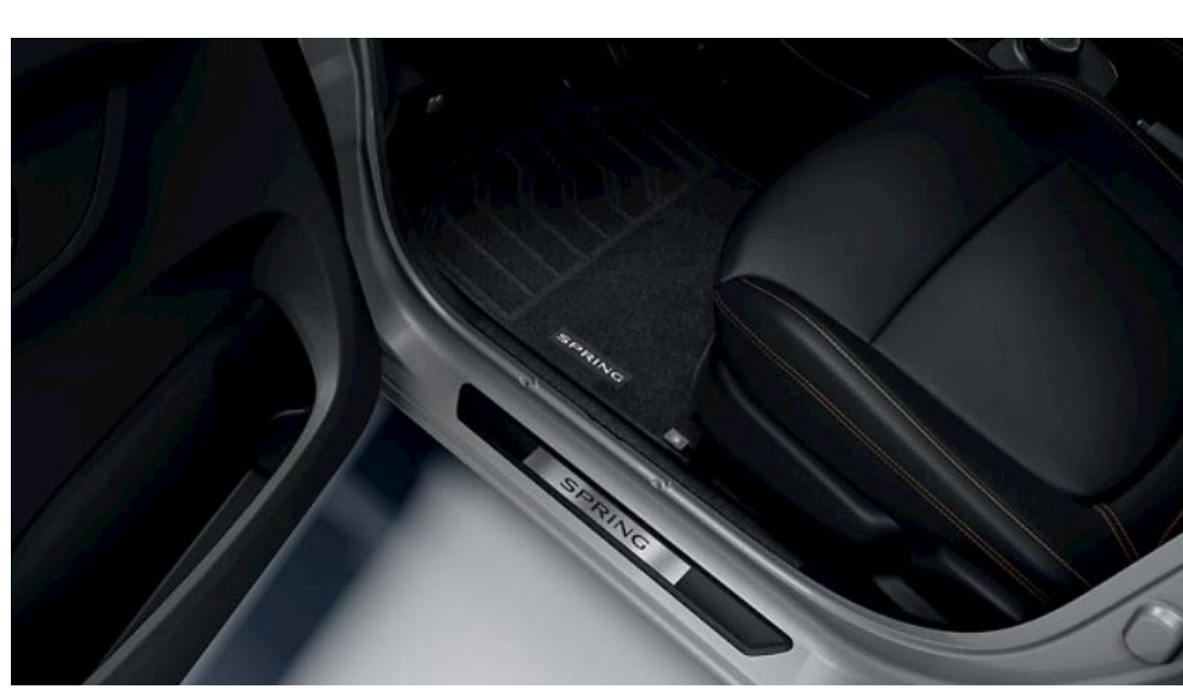
Front door sills