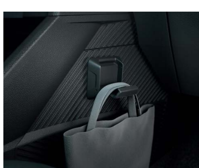
YouClip - hook