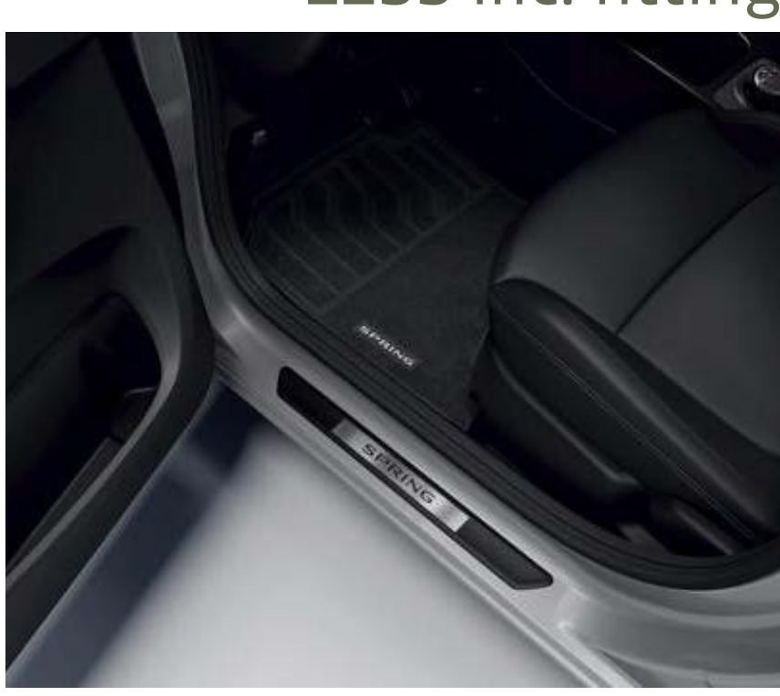
Front door sills