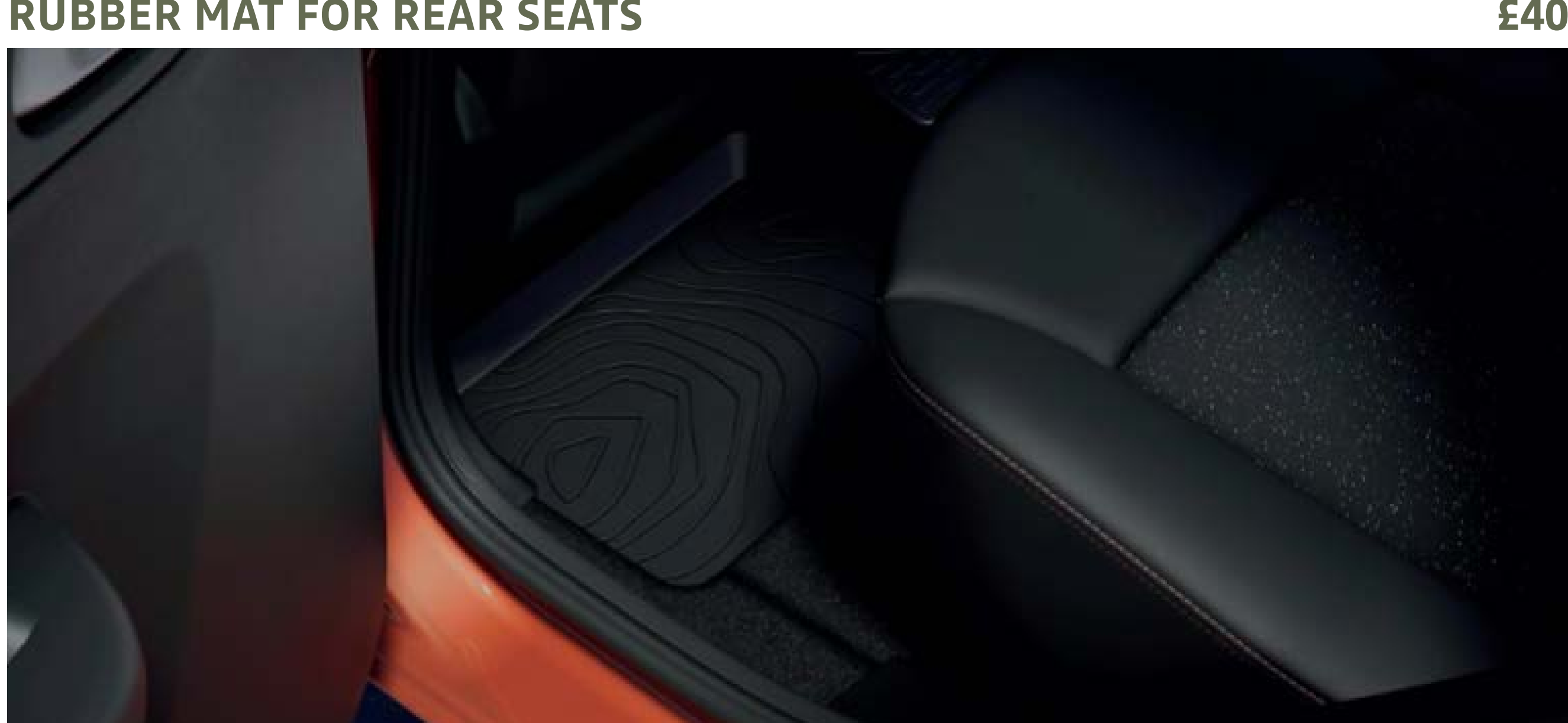
Rear rubber mats