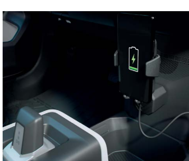
YouClip - wireless smartphone charger