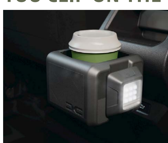
YouClip - 3 in 1 (cup holder + lamp + hook)